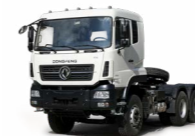
KC 6x4 420 ADR OPTIONAL