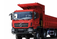
KC 8x4 420 MINING