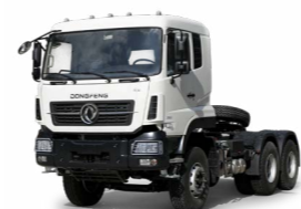
KC 6x4 380 ADR OPTIONAL