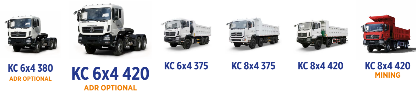
KC 6x4 380 ADR OPTIONAL