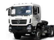
KC 6x4 380 ADR OPTIONAL