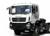
KC 6x4 420 ADR OPTIONAL