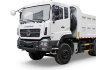
KC 8x4 375