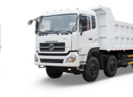
KC 8x4 420