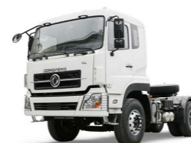
KL 4x2 315