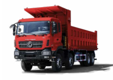
KC 8x4 420 MINING