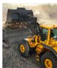
Volvo Construction Equipment