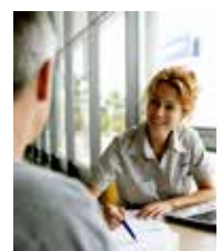
Volvo Financial Services