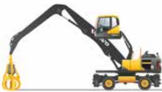
EW240E (Material Handler)