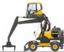
EW160E (Elevated Cab)