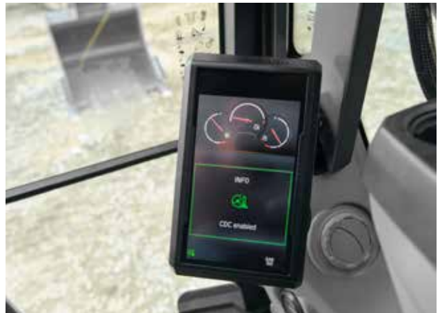
Comfort Drive Control